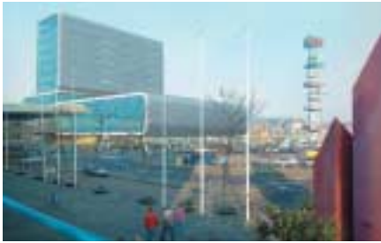
Artist impression RAI Elicium.

Tuesday, February 10 and Wednesday, February 11 the exhibition at Aquaterra 2009 will be the central focal point for networking and information transfer. This unique event, designed to match supply and demand in the industry,